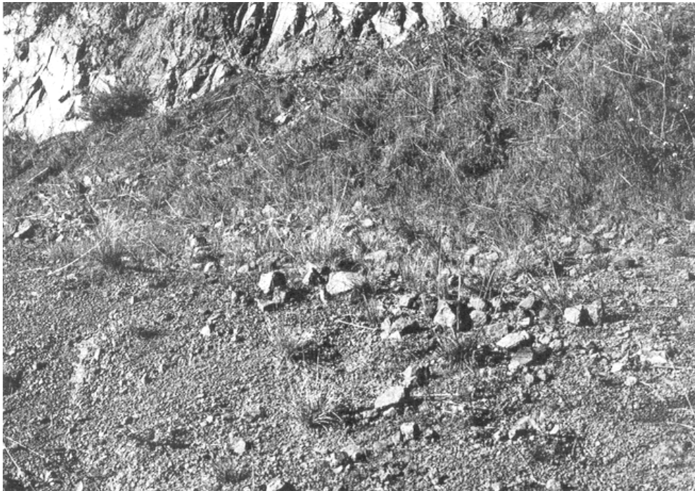
Seedlings of Stipa pulchra can be seen in the foreground invading an abandoned road in Tilden Park, Berkeley. Parent plants are growing on the bank above.

Why is Stipa pulchra more common than other native bunchgrasses? This question may best be answered by examination of some of the ecological characteristics of the species. One such characteristic is that Stipa pulchra produces large quantities of viable seed. In dense vigorous stands the seed output may exceed two hundred kilograms per hectare. Seeds are relatively large and highly viable. The twisting awn and pointed seed ensure self-burial, and seedlings grow vigorously. These reproductive characteristics enable the species to colonize disturbed sites rapidly, provided a seed source is present. The occurrence of Stipa pulchra along road cuts and similar disturbed habitats reflects this superior colonizing ability. Other native perennial grasses seldom become established so vigorously. Once established, young Stipa pulchra plants quickly produce seeds. Under favorable conditions, two-year-old plants may flower and set seed.