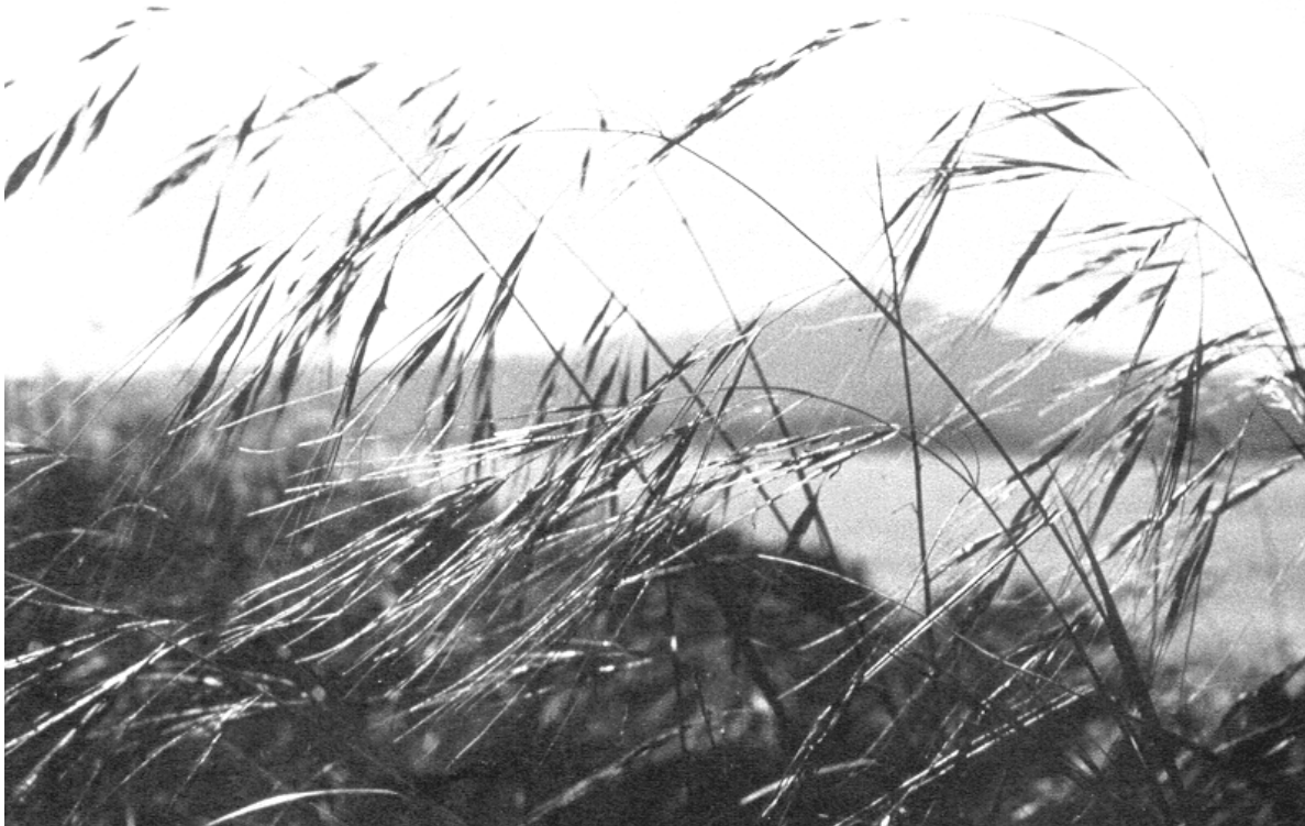
Purple needlegrass at Point Molate with Mt. Tamalpais in background.